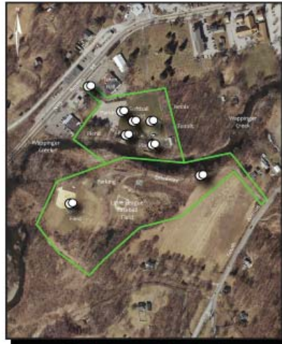
Cady Recreation Park