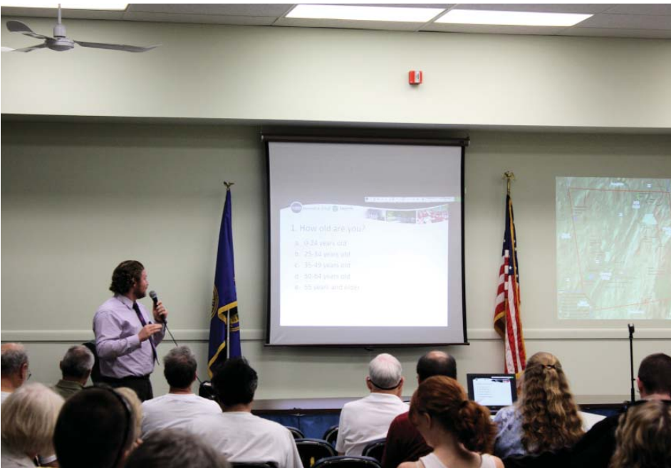
Figure 1-5 Interactive polling exercise at June 7, 2011 Community Meeting