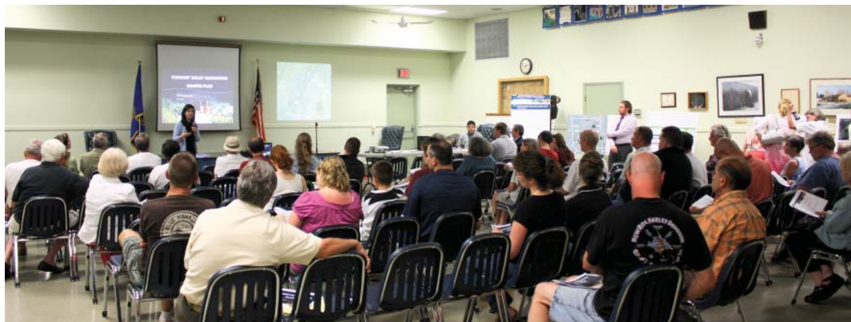
Figure 1-4 Attendees at the June 7, 2011 Com- munity Discussion

In addition to the two public meetings held during the Recreation Planning Process, an on-line recreation preferences survey was conducted during the months of July and August 2011. Approximately 300 responses to the survey were analyzed and aggregated to form the basis for several of the recommendations