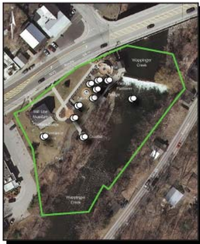
Mill Site Museum and Memorial Park