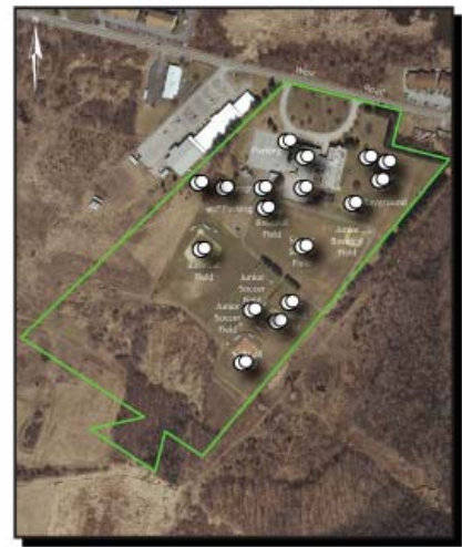
West Road School