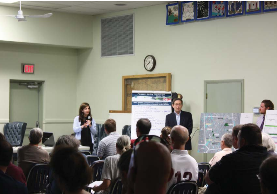
Figure 1-1 Goals and Objectives Exercise at June 7, 2011 Community Meeting

The Recreation Master Plan will assist the Town in making intelligent decisions about its future recreation policies, particularly with respect to maintenance and enhancement of existing facilities. The purpose of the Plan is to make those decisions clear and prioritize projects in relation to the Town's needs and available resources. The document is dynamic and meant to affect change in the way Pleasant Valley plans for its future recreation needs.