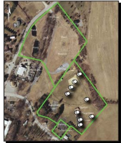
Helen Aldrich Park